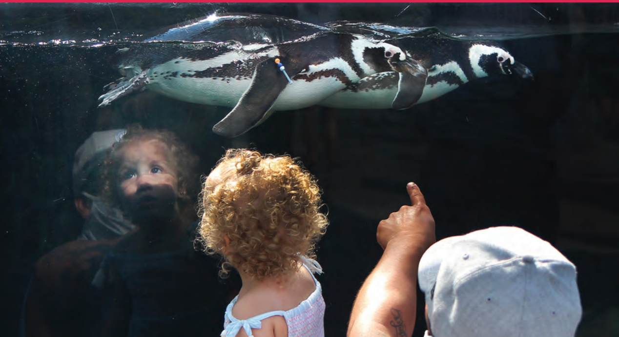
A child watches penguins at the Aquarium of the Pacific in Long Beach.