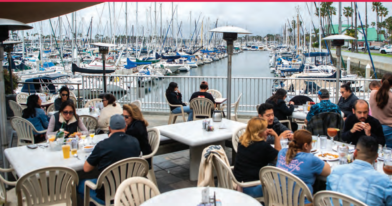
Schooner or Later offers a beautiful view of Alamilto Bay marina.