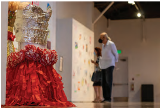
Visitors view artwork at the Museum of Latin American Art.

When it's time to leave Compound, drive around the city to see its incredible murals. They are such a part of the fabric of Long Beach that we have a People's Choice category for this: This year's winner is the DREAMer mural (near