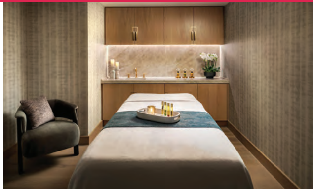
The spa at Fairmont Breakers Hotel

And don't forget the manicure! Our readers this year chose Bliss on Broadway (4032 E. Broadway) as the best nail salon, and runner-up Hey Nice Nails (316 Elm Ave.) in the East Village. ●