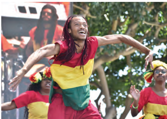
The Long Beach Juneteenth Festival takes place June 14.