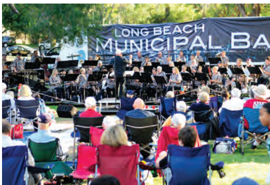
The Long Beach Municipal Band is back for its 116th season.

duction by Shakespeare by the Sea, "As You Like It," at the city's bandshell (701-939 Federation Drive), along with additional performances this summer. Showtime is 7 to 10 p.m. For details: liveattheshell.org/shakespeare .