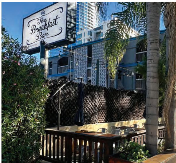
The original Breakfast Bar in Downtown Long Beach

Other great brunch spots include Nick's on 2nd (4901 E. Second St.), and stay for dinner; you won't be disappointed with anything on the menu here. If Nick's is busy, go across the street to Saint & Second (4828 E. Second St.) for a classy brunch that also shines. ●