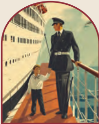
QUEEN MARY + FAMILY PASS SHARE THE EXPERIENCE WITH THE WHOLE CREW