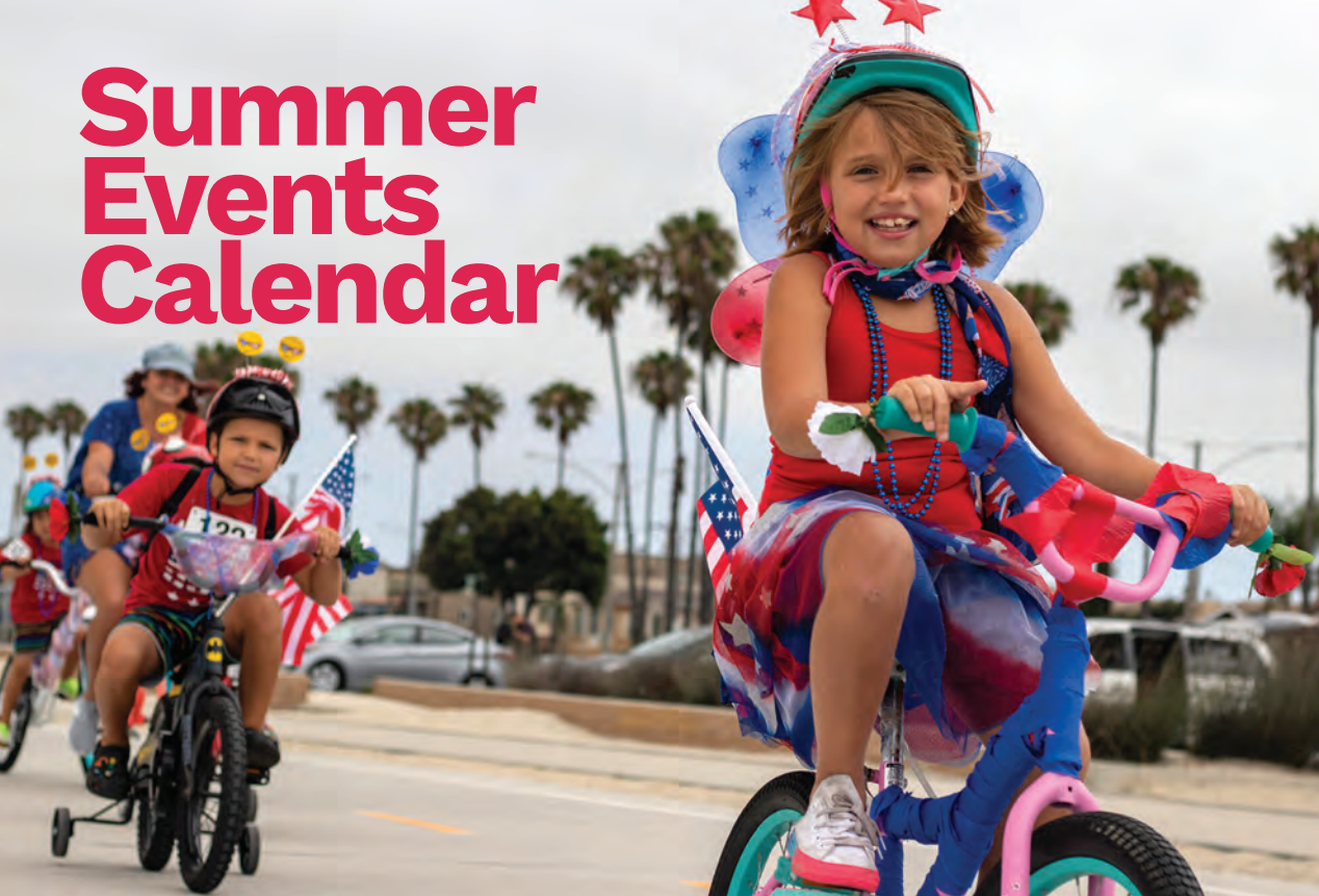
The Great American 4th of July Kids Bike Parade

Live music, food, culture — Long Beach has it all. The summer is packed with events for kids and adults, singles and families, and everyone in between.