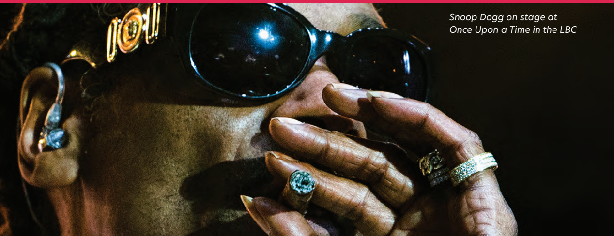
Snoop Dogg on stage at Once Upon a Time in the LBC