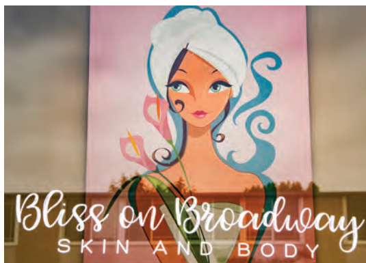
Bliss on Broadway