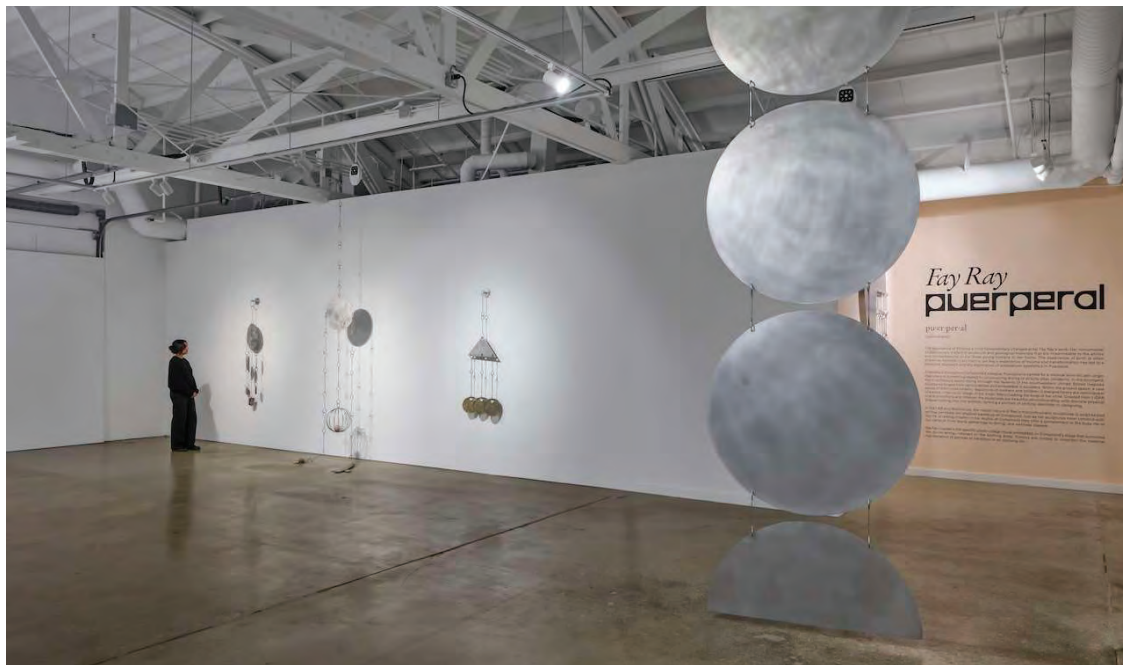
Fay Ray's solo exhibition, "Puerperal," at Compound

a clear day, you can see Catalina Island from the deck.