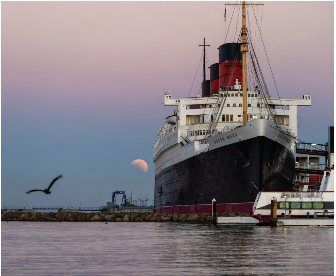
The flower moon rises behind the Queen Mary.

a Fourth of July barbecue. Visit aquarium.org .