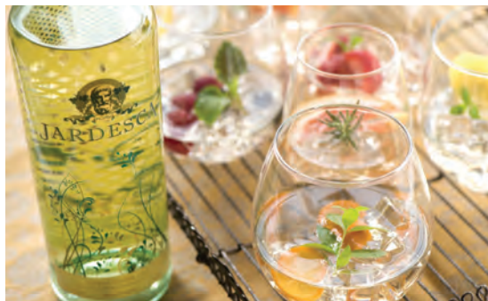
The Jardesca Aperitiva cocktail at District Wine

When you're ready to hit the hard stuff, The Bamboo Club (winner) and runners-up Baby Gee (1227 E. Fourth St.) — try the key lime colada — and The Ordinarie (210 The Promenade N.) are our reader recommendations in this year's poll. The Bamboo Club, a festive Tiki bar in the Zaferia neighborhood, offers all things rum and paper umbrellas. Get the Sunken Siren, and the Thai tea-brined fried chicken sandwich.