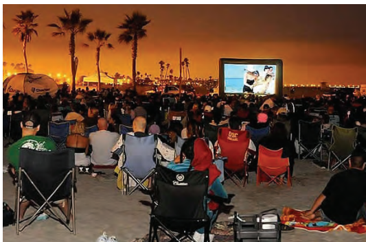
Moonlight Movies on the Beach returns in 2025.