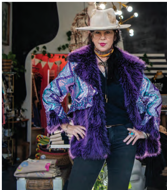
Retro Row is one of the city's most popular shopping destinations.

Clothing Co. (4218 Atlantic Ave.) and Stay Anchored (4150 McGowen St.).