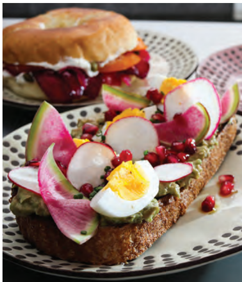
Ubuntu Cafe near the Colorado Lagoon