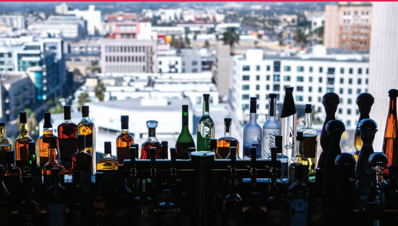
A view from the Sky Room at the Fairmont Breakers Hotel