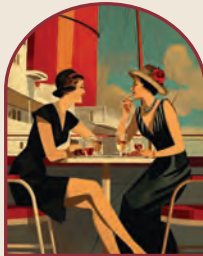
QUEEN MARY + PASS EXPLORE, DINE, & DISCOVER ALL YEAR LONG