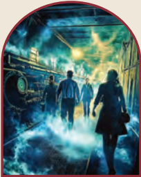
SPIRITED PASS A HAUNTED TWIST TO OUR QUEEN MARY + PASS