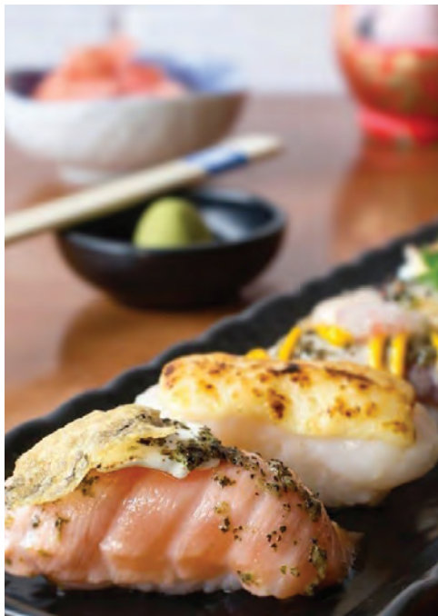
The variety plate from Sushi Nikkei

This year's winner, The Wild Chive (2650 E. Broadway), worked hard for its brick-and-mortar location in Bluff Park by hosting pop-ups for years throughout the city. The Grain Cafe (4403 E. Fourth St.), with its eclectic menu and cheery exterior, comes in as runner-up. ●