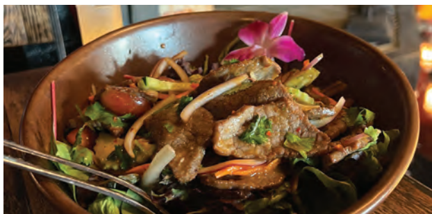
The steak salad at Thai District in Downtown

Speaking of awards, Heritage (2032 E. Seventh St.) is the first restaurant in the city to earn a Michelin Star. Reservations are a must. You might have already heard about Ammatoli (285 E. Third St.) in Long Beach, which was recognized by the James Beard Awards and the Los Angeles Times' Best 101 Restaurants. It's earned the hype.