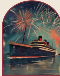
VIP PASS A TOP TIER YEAR-ROUND EXPERIENCE