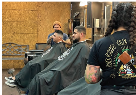
Employees at American Vintage Barbershop cut a customer's hair.