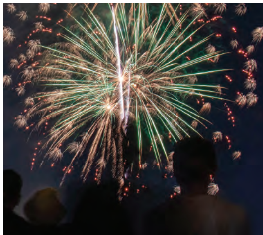
The Big Bang on the Bay happens July 3.

June 29: The Dia de San Juan Festival at Rainbow Lagoon Park with bands, food and more: fiestalegre.com .